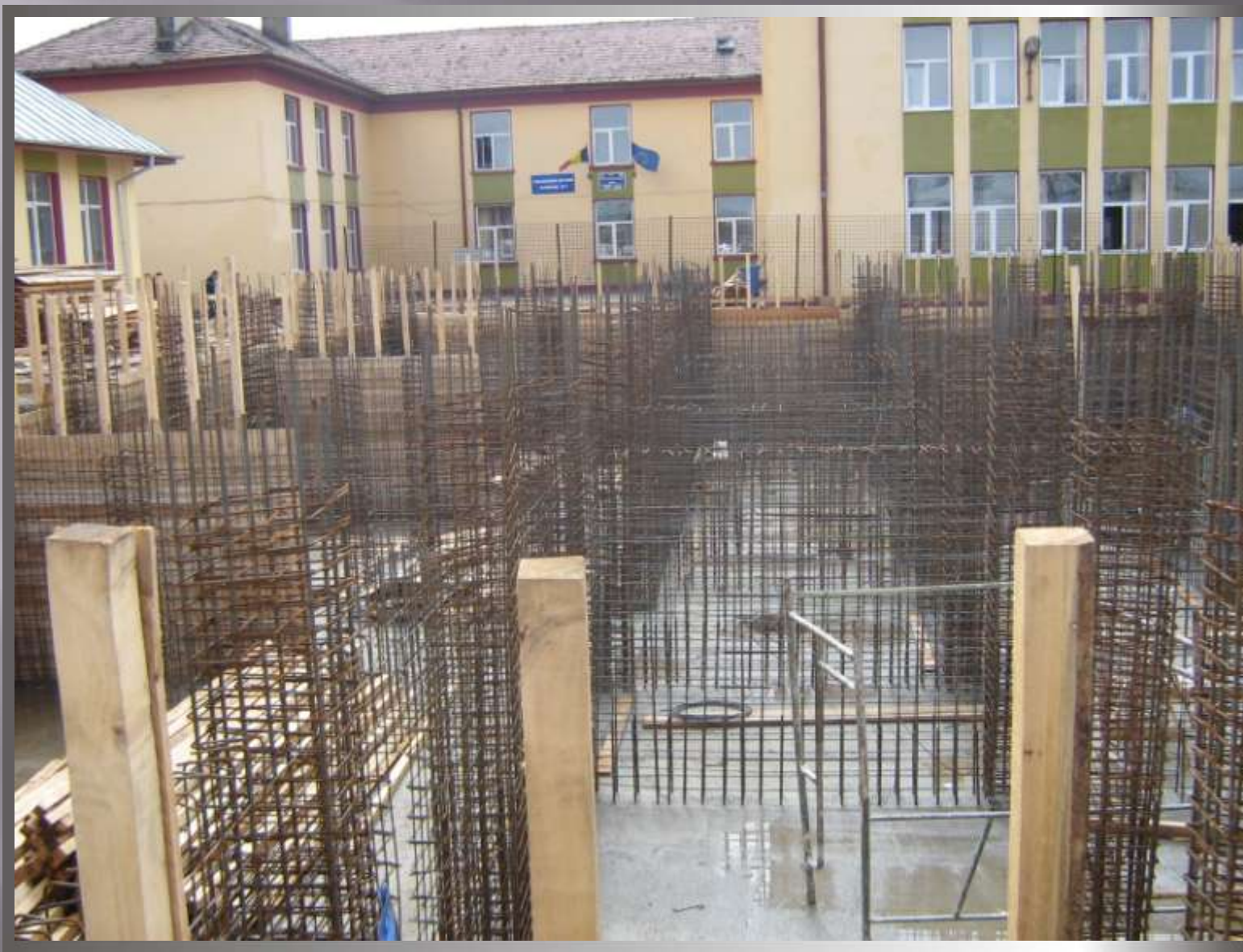
HIGH SCHOOL POPESTI LEORDENI