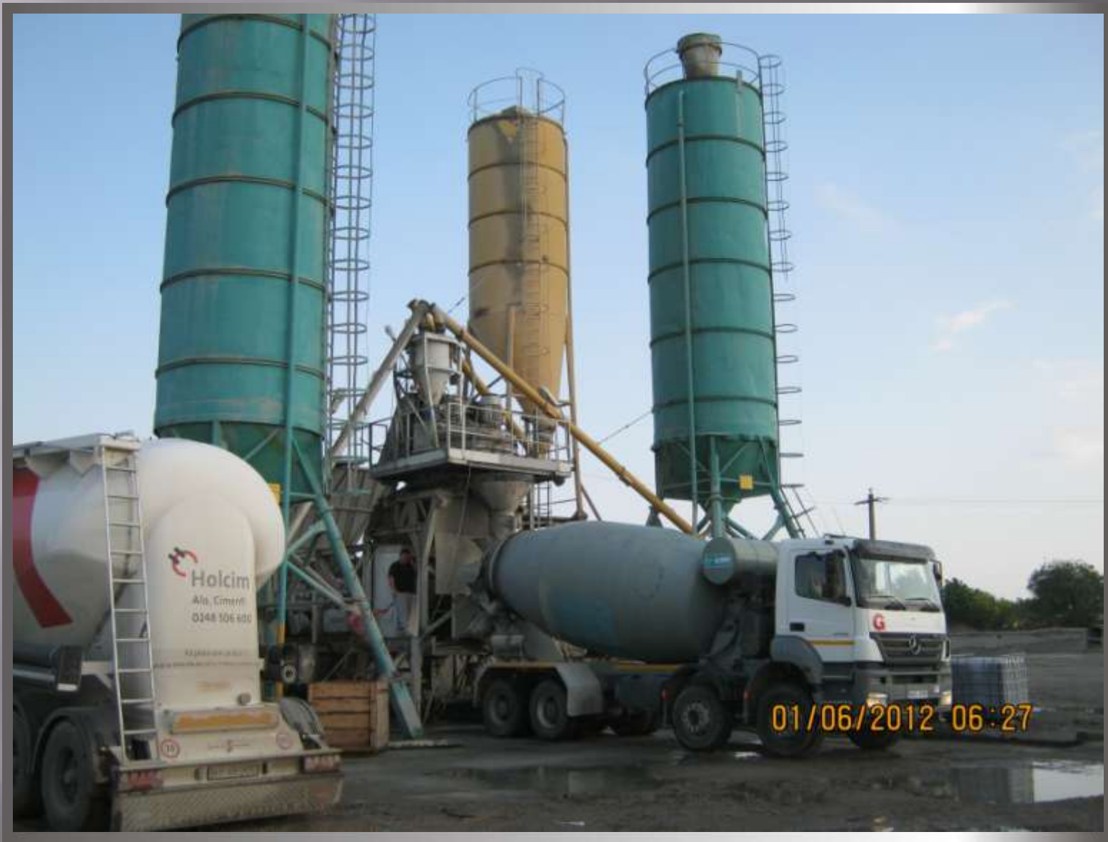
TRUCK MIXER - ZEBIL