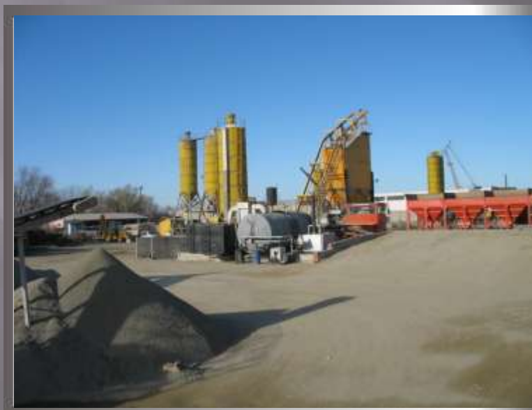
ASPHALT PLANT SPEEDCRAFT IZVOARELE