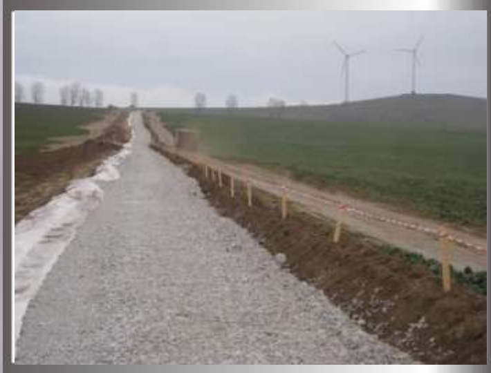
WIND FARM ACCESS ROAD CARA CONSTANTIN