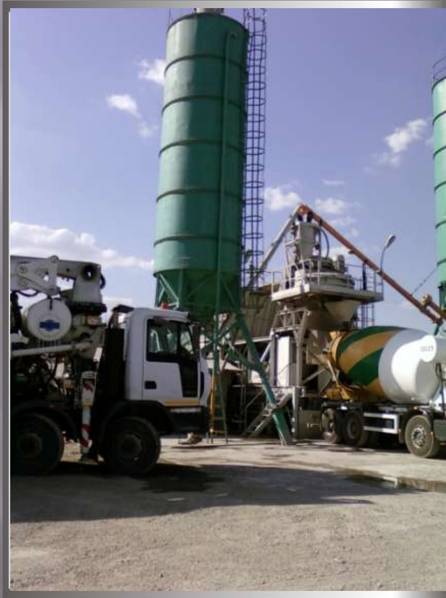
CONCRETE PLANT - ZEBIL