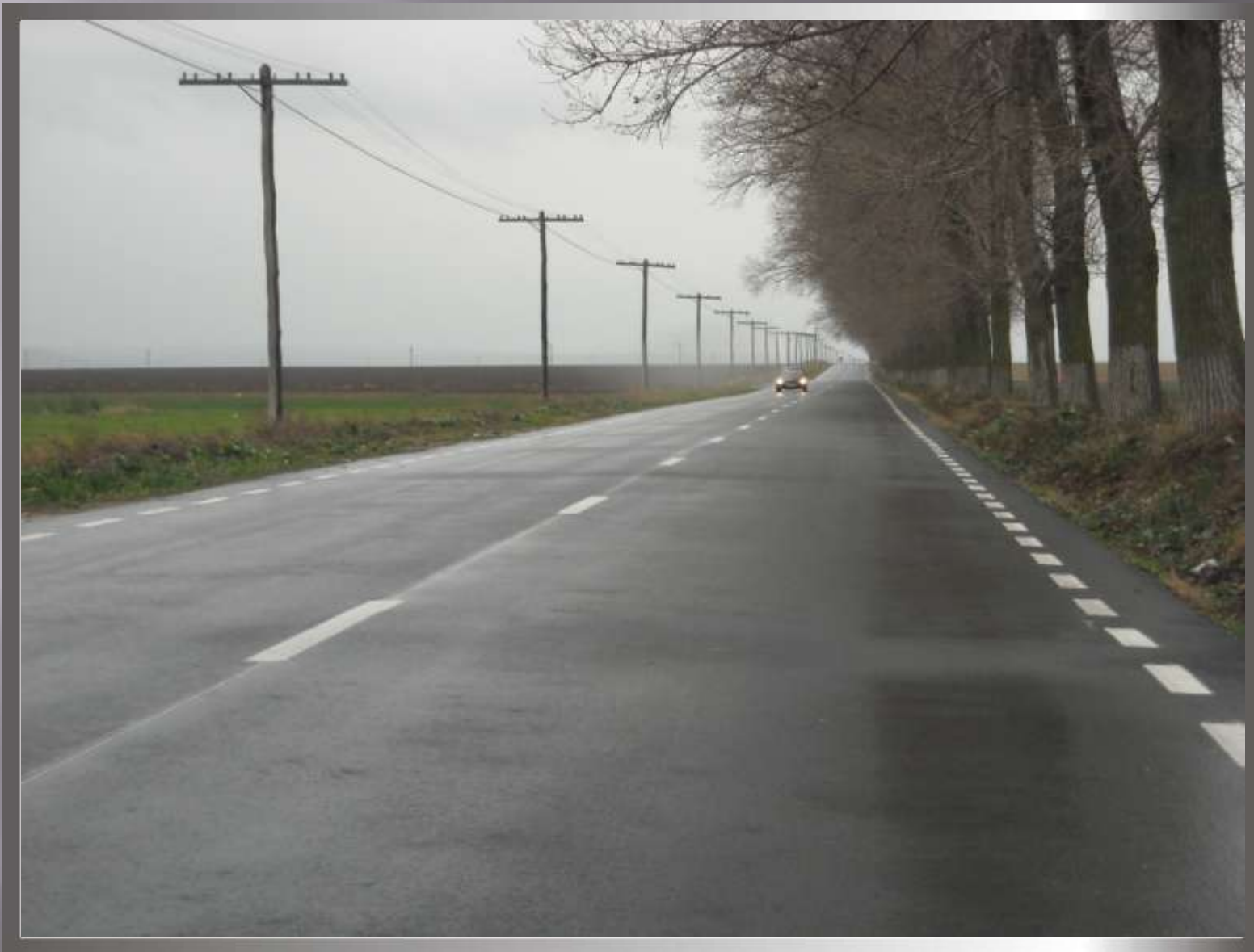
DJ 222 ROAD REHABILITATION JURILOVCA TULCEA