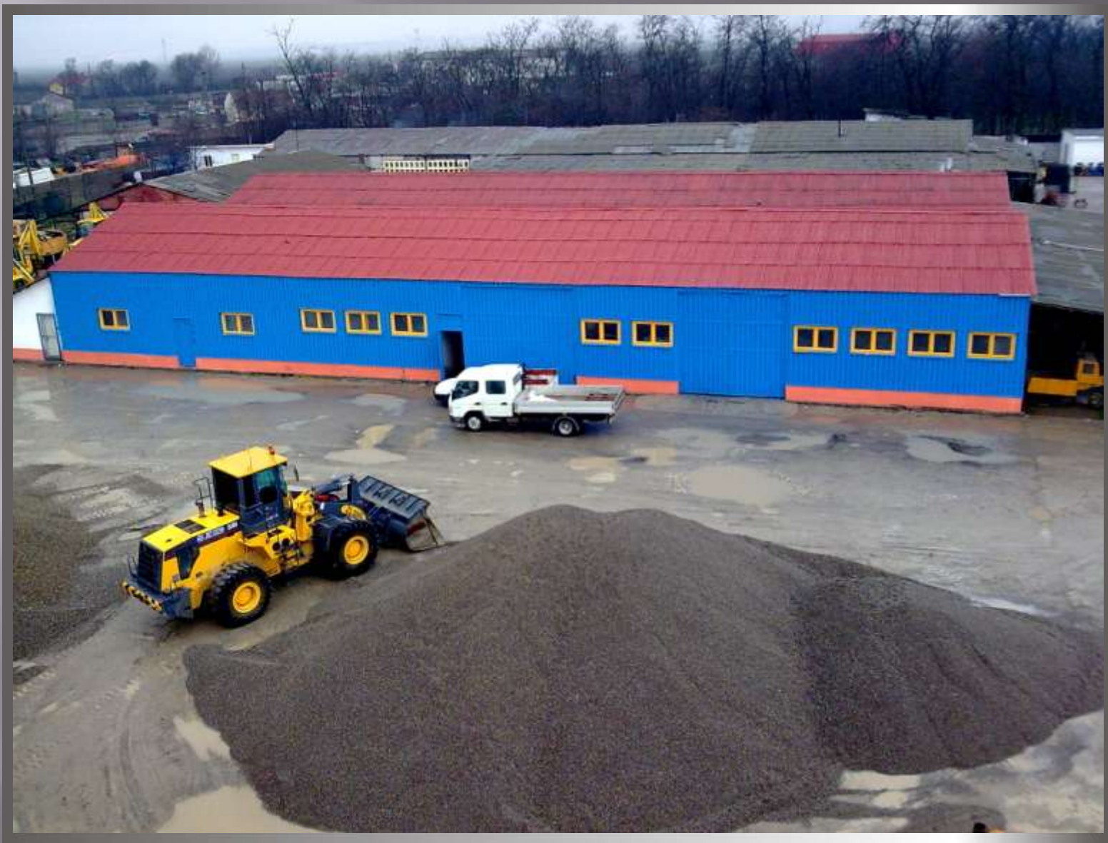
AUTO REPAIR HALL