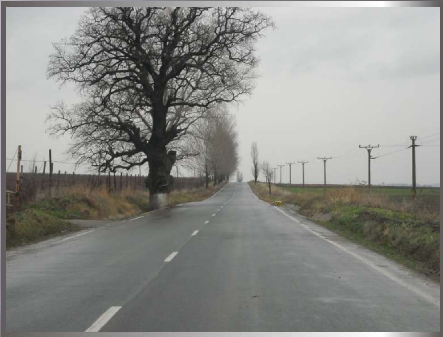
ROAD REHABILITATION DJ223A ENISALA BABADAG