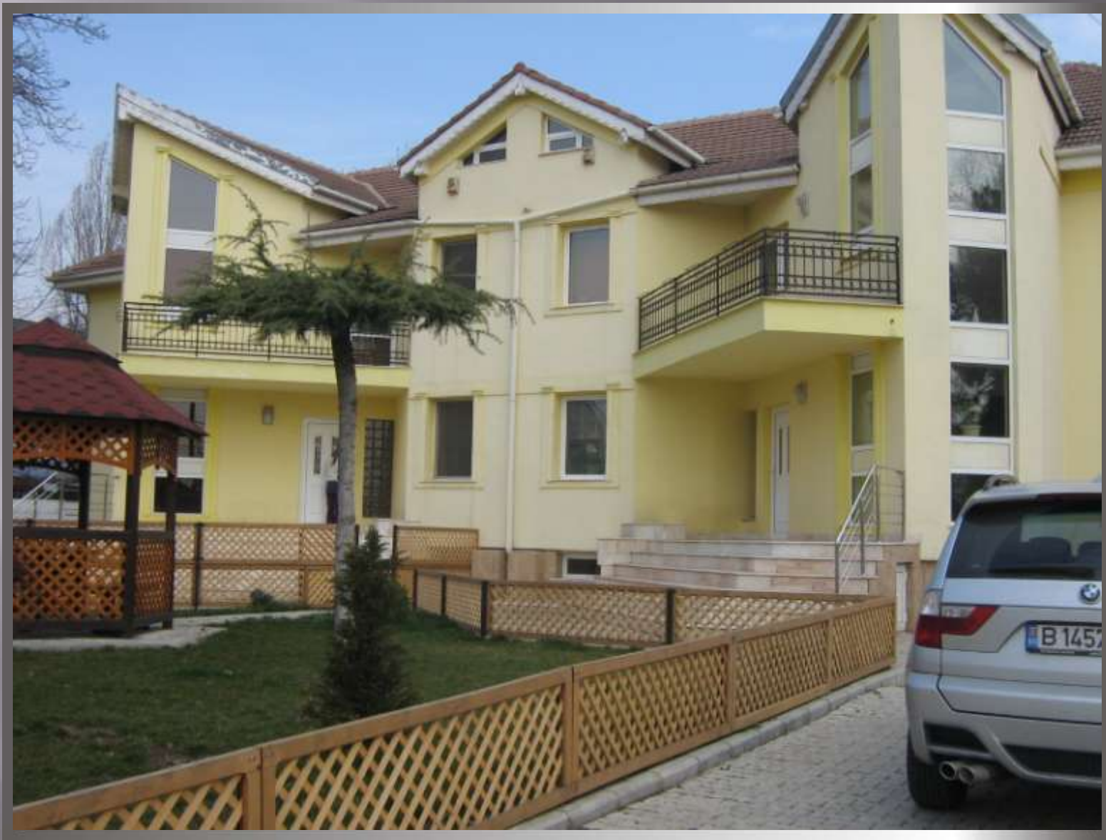
RESIDENTIAL BUILDING - ENACHE