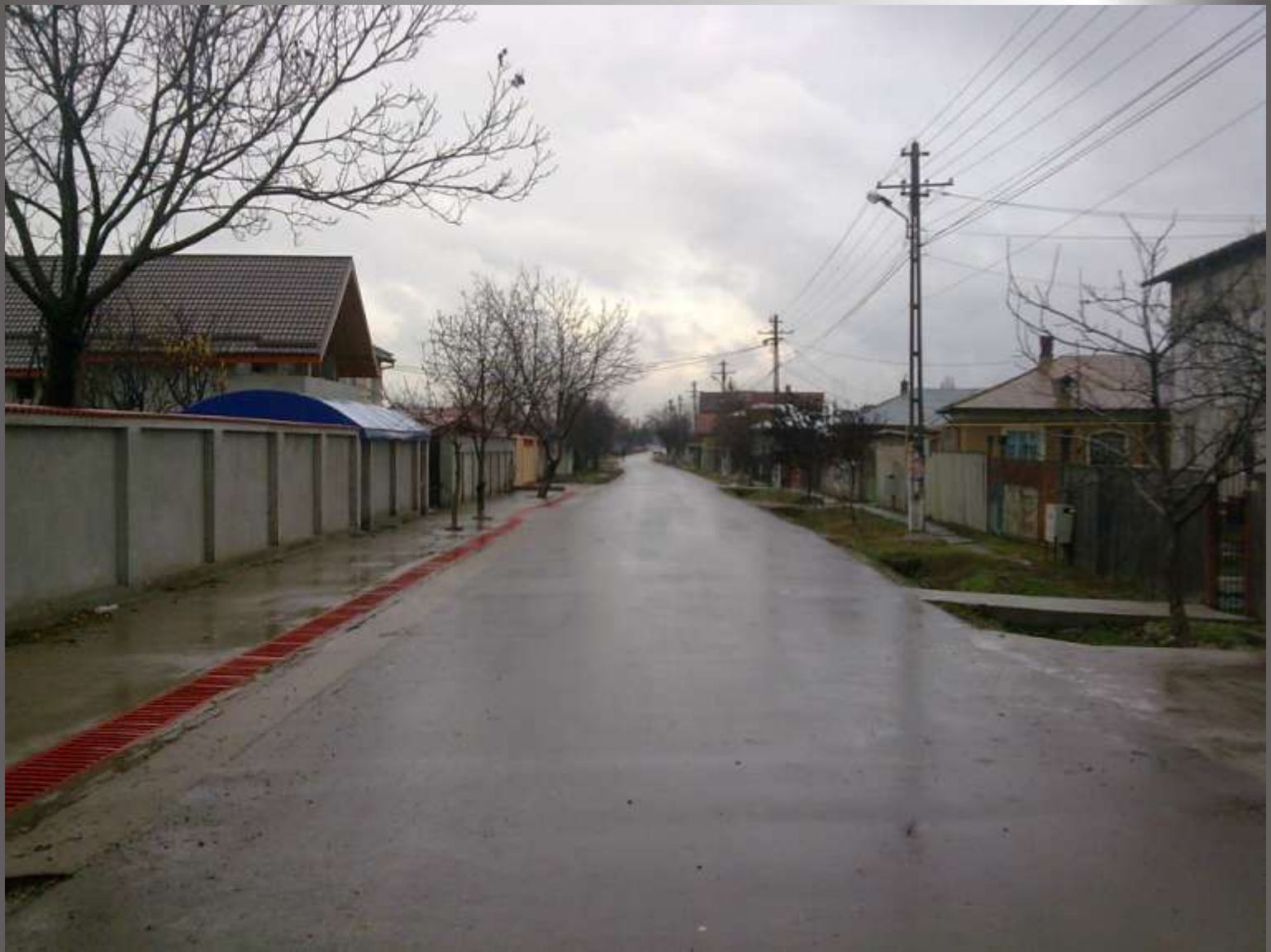
ROAD REHABILITATION - AFUMATI