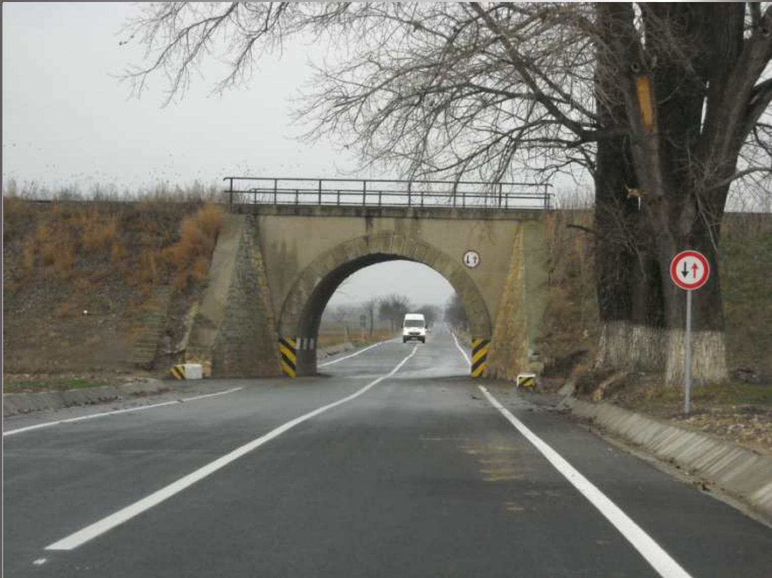
DJ65 CEAMURLIA TULCEA ROAD REHABILITATION