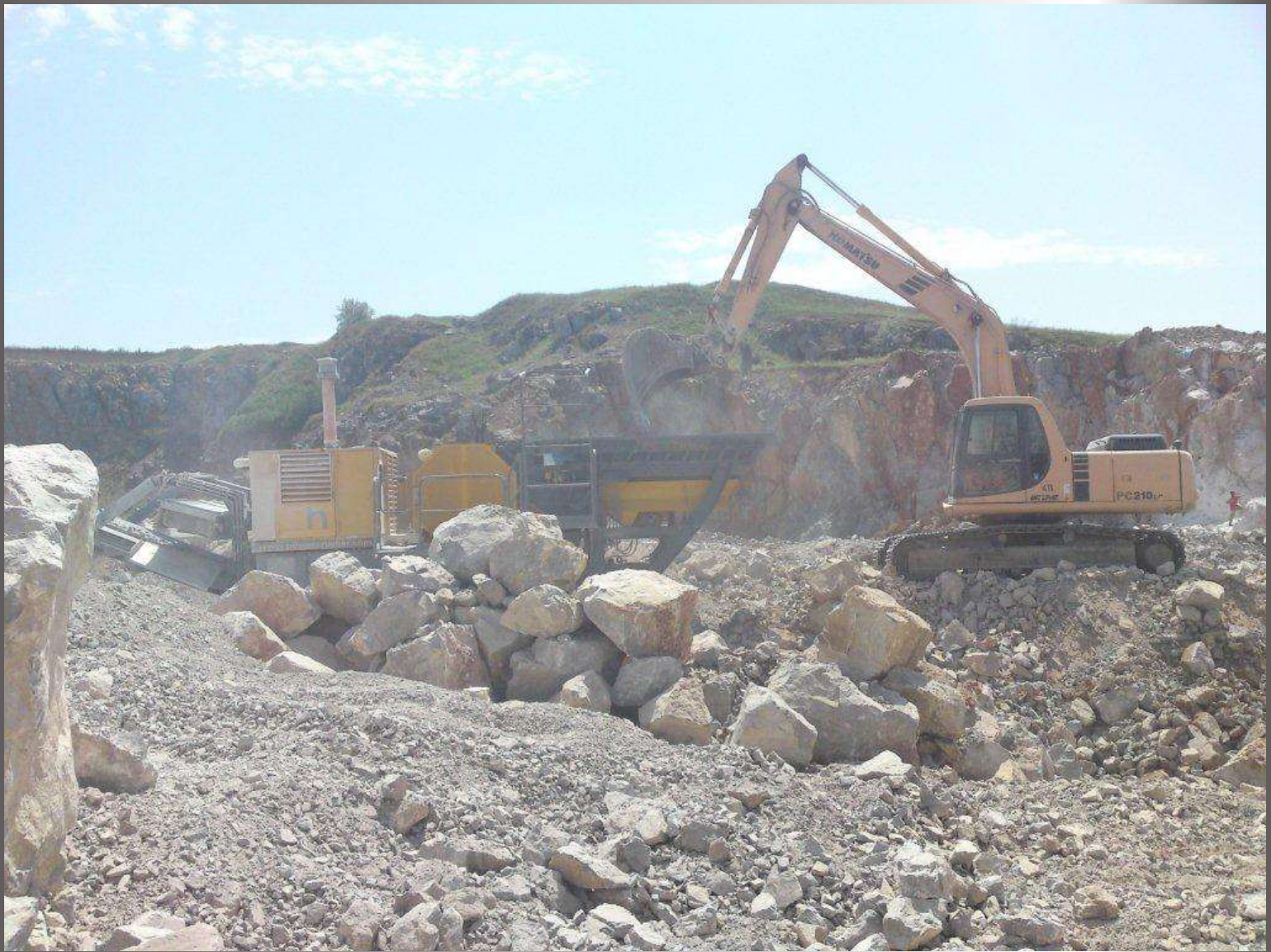
GRINDER WITH EXCAVATOR- ZEBIL QUARRY