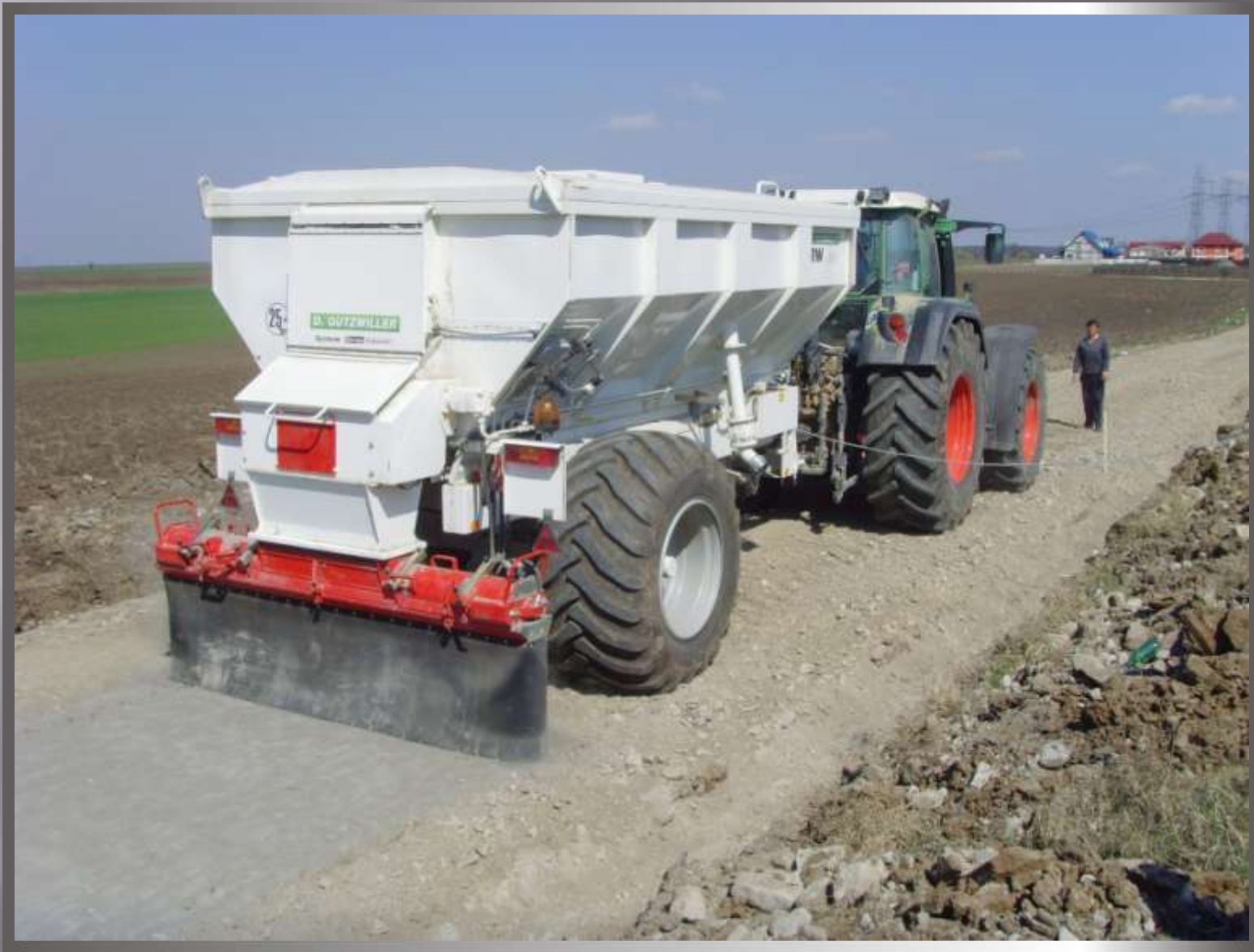
EQUIPMENT MANUFACTURING STABILIZED BALLAST