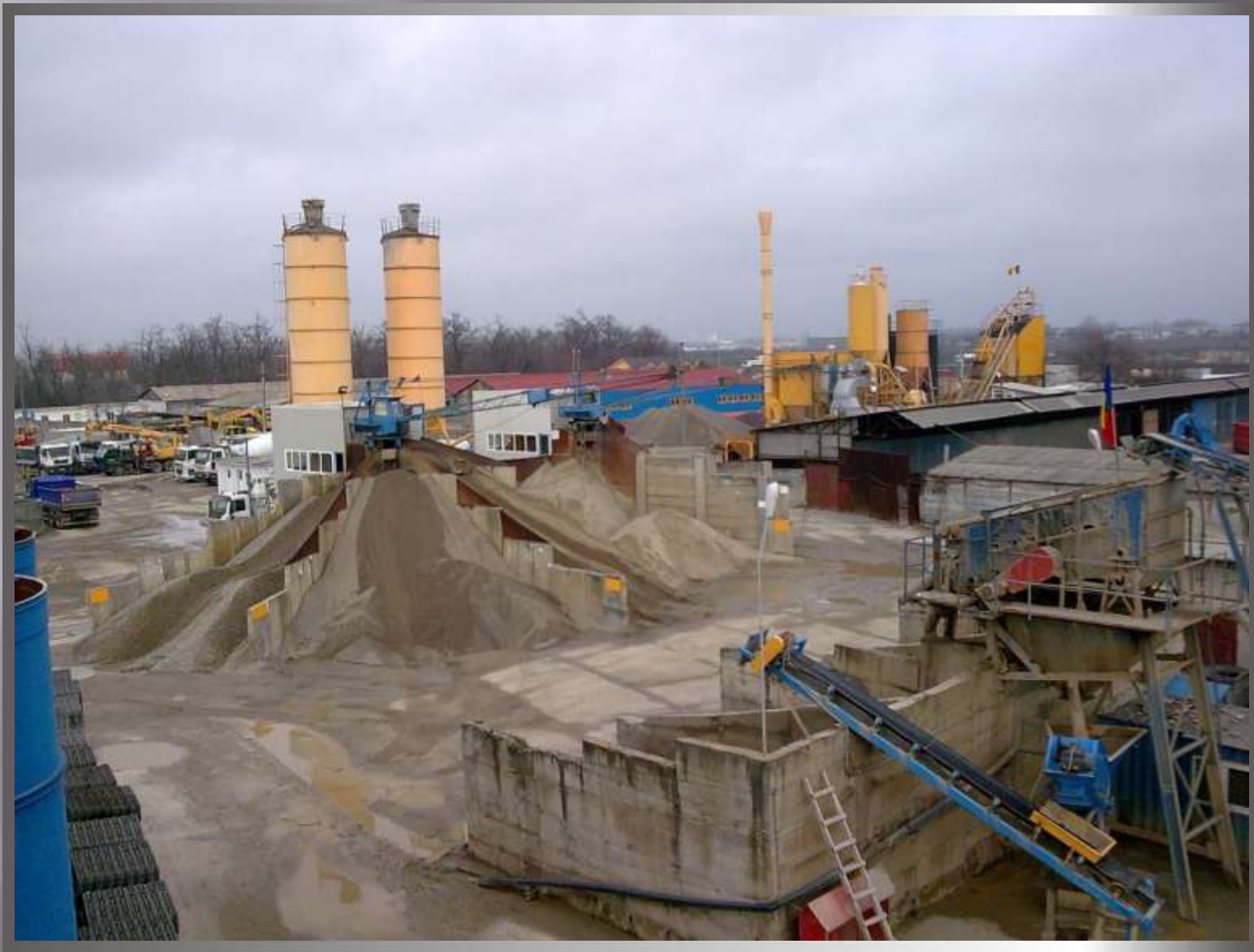
CONCRETE PLANT NO.1 POPESTI