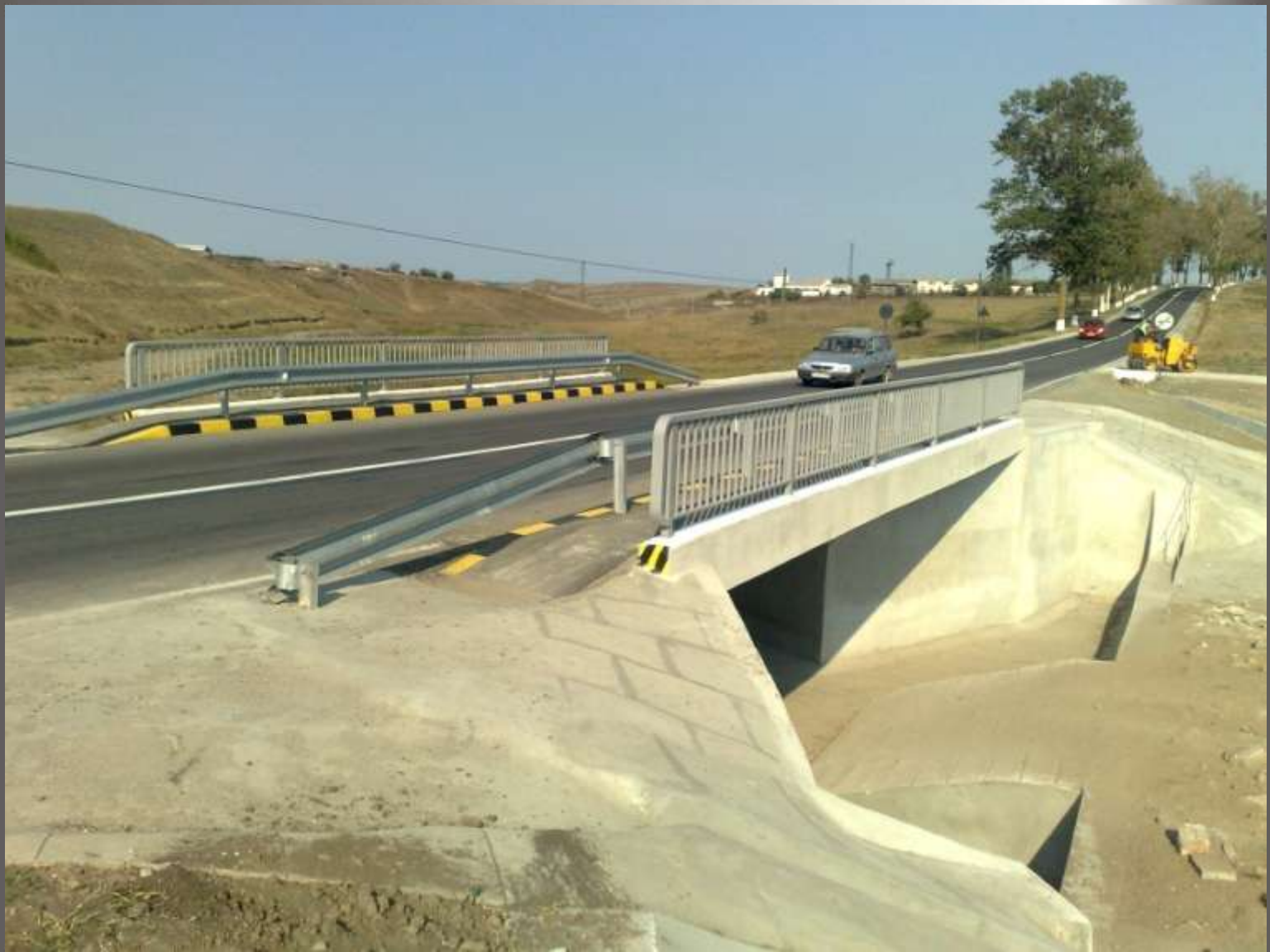
IMPROVING ACCESS INFRASTRUCTURE IN TOURIST AREA MURIGHIOL-UZLINA-DUNAVAT_LAKE RAZIM