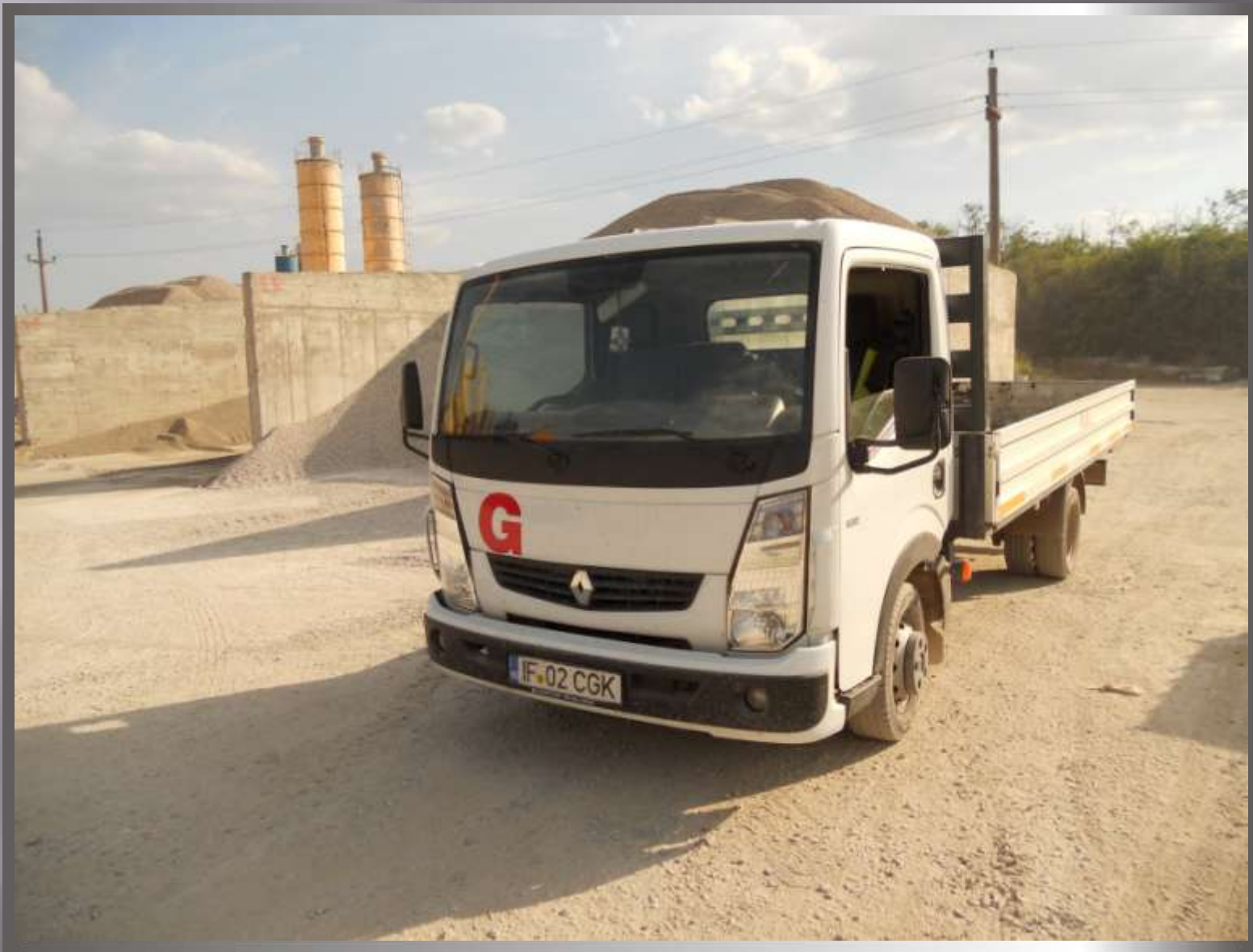
TRUCK -3.5 TON