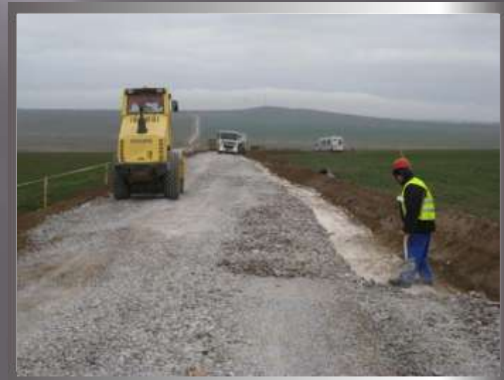
WIND FARM ACCESS ROAD CARA CONSTANTIN