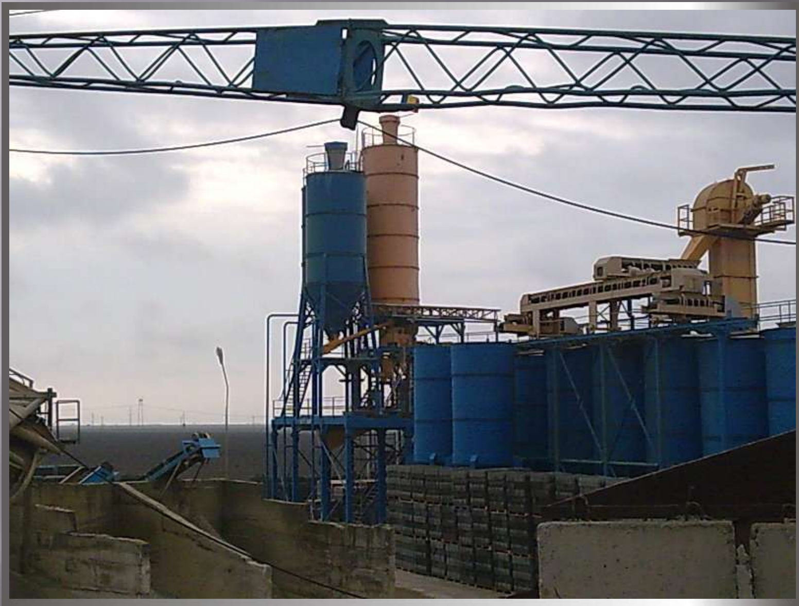
AUTOMATIC BANCHING PLANT