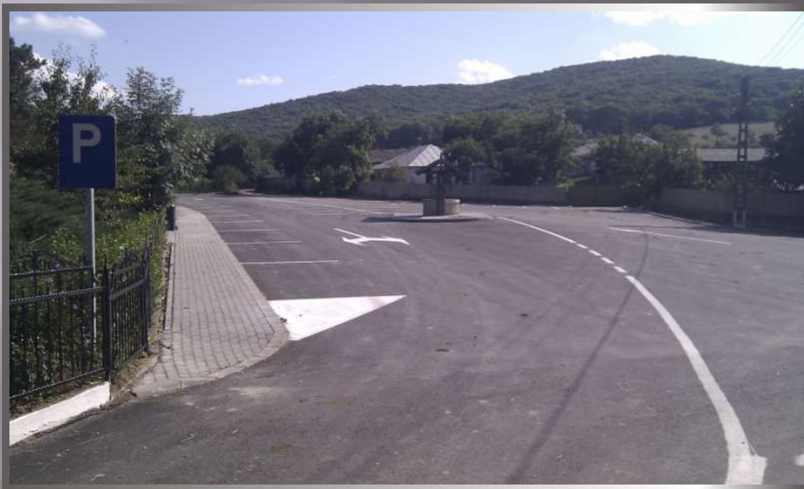
TULCEA MONASTERIES TOURISM ENHANCEMENT