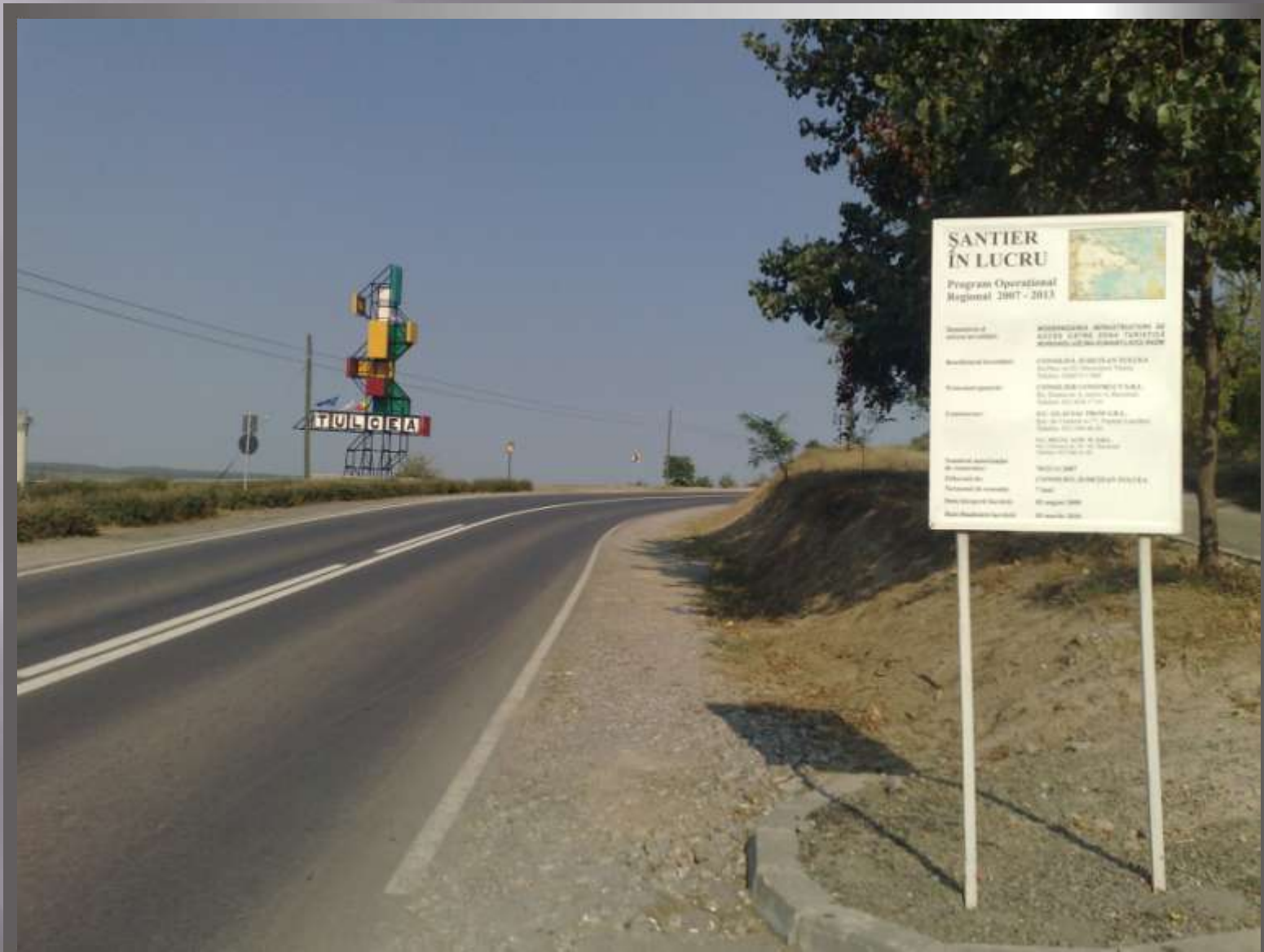
IMPROVING ACCESS INFRASTRUCTURE IN TOURIST AREA MURIGHIOL-UZLINA-DUNAVAT_LAKE RAZIM