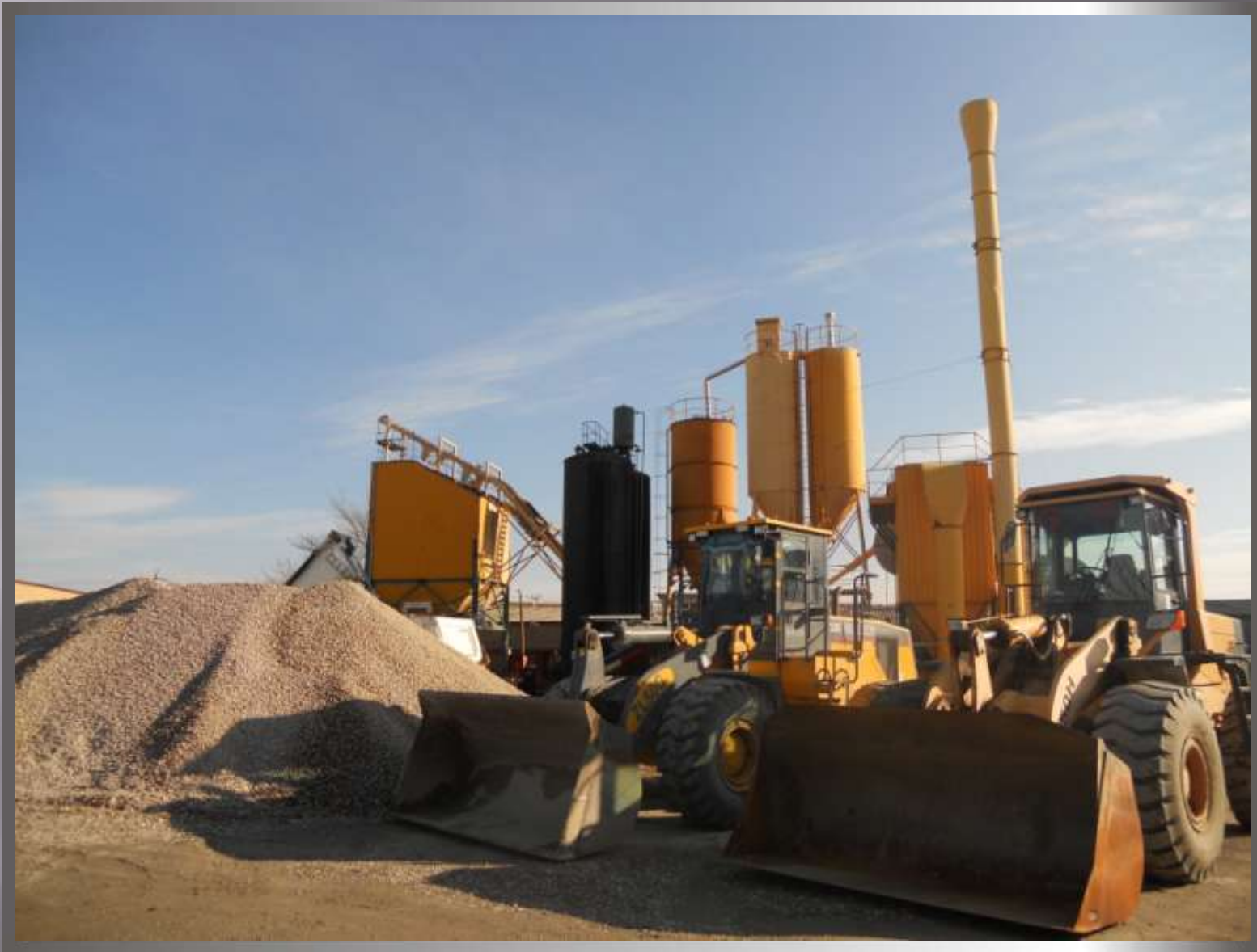
ASPHALT PLANT POPESTI