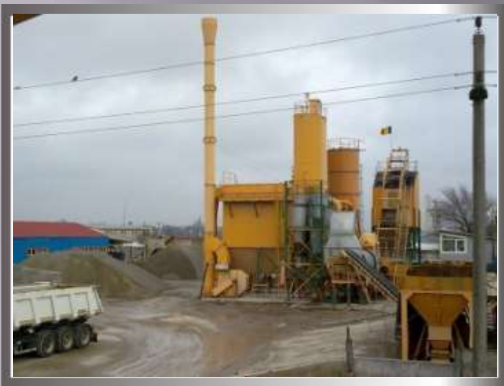
ASPHALT PLANT POPESTI