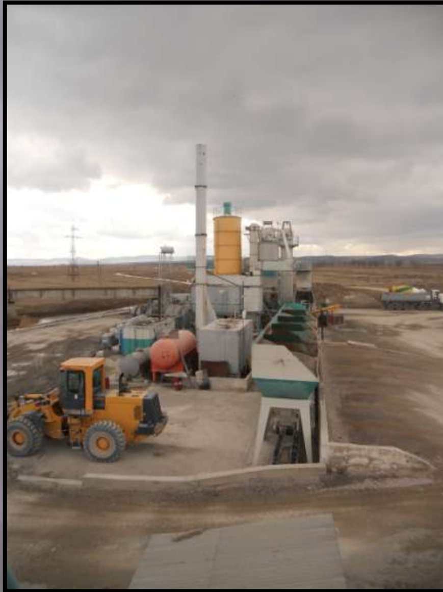
ASPHALT PLANT ZEBIL