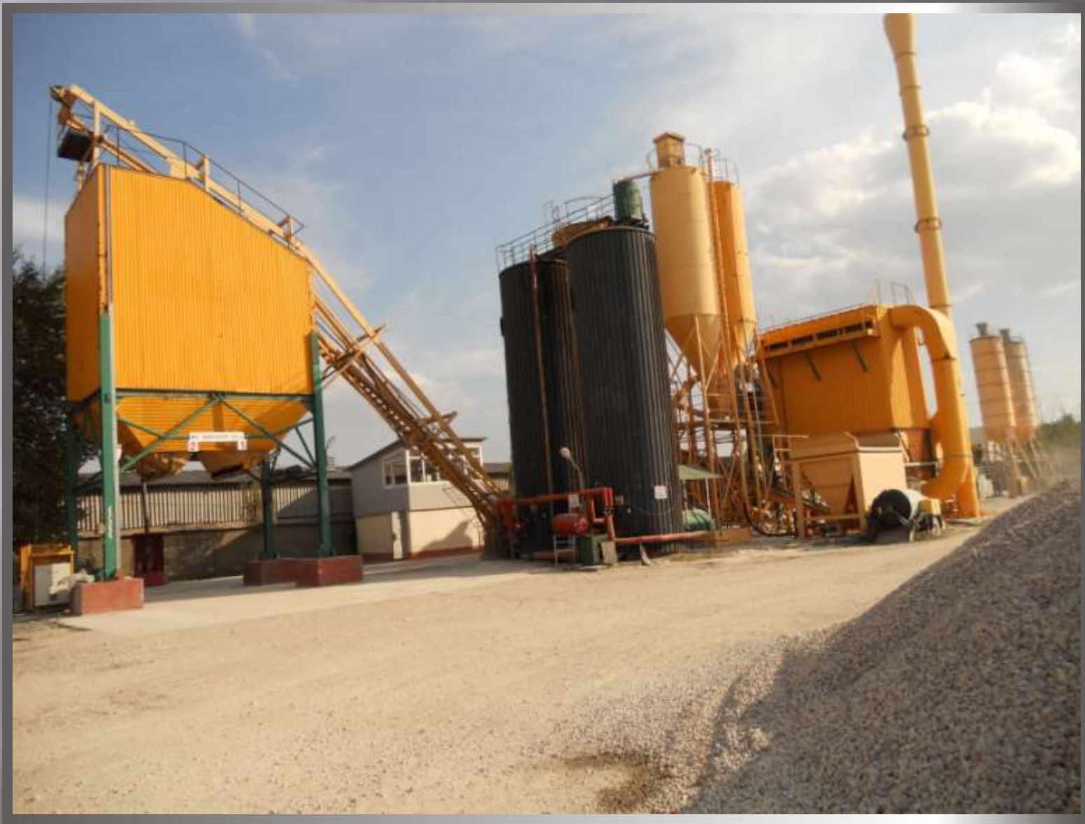
ASPHALT PLANT POPESTI