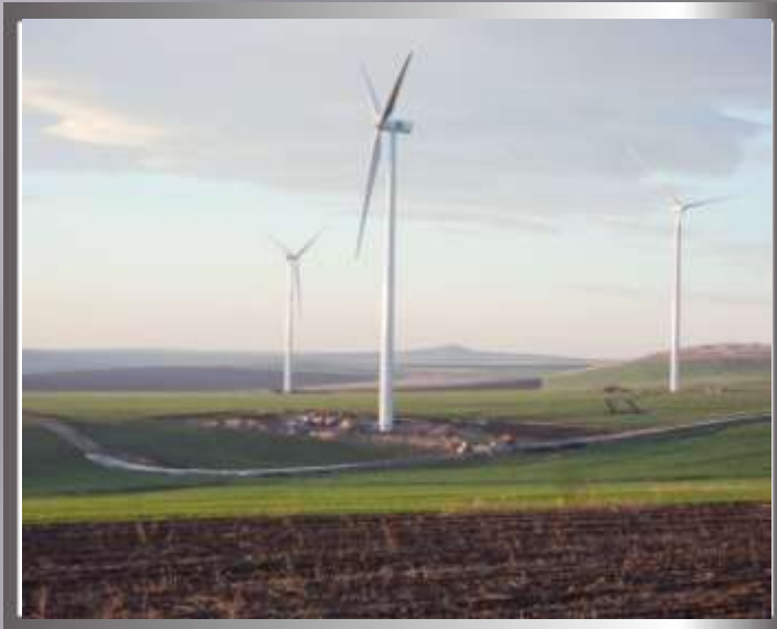
CARA CONSTANTIN AGIGHIOL WIND FARM, TULCEA