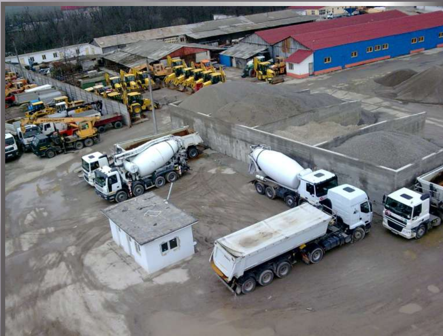
EQUIPMENTS - POPESTI LEORDENI-