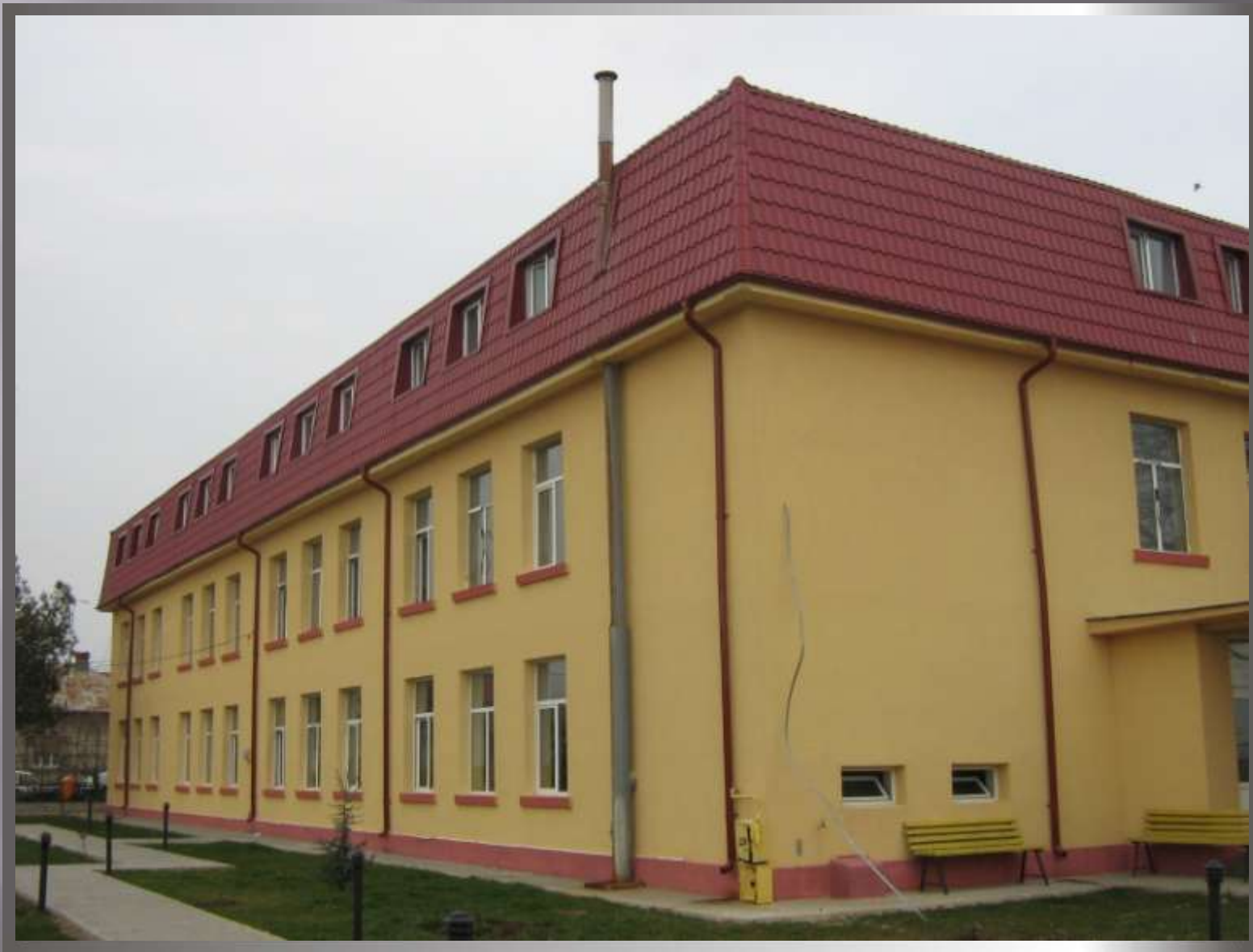
HIGH SCHOOL - VIDRA