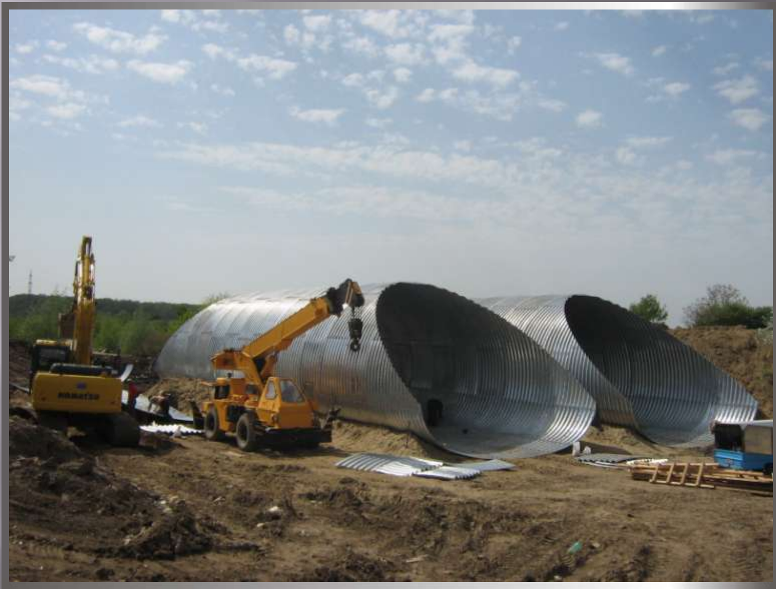
BRIDGE VIDRA, ILFOV