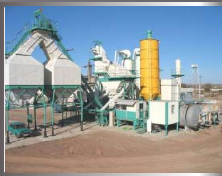
ASPHALT PLANT TELTOMAT