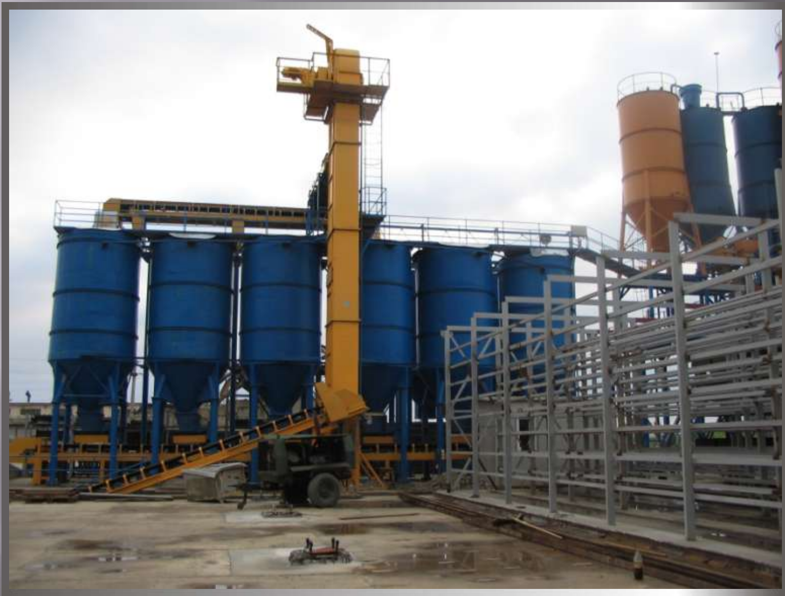
CONCRETE PLANT NO.2 POPESTI