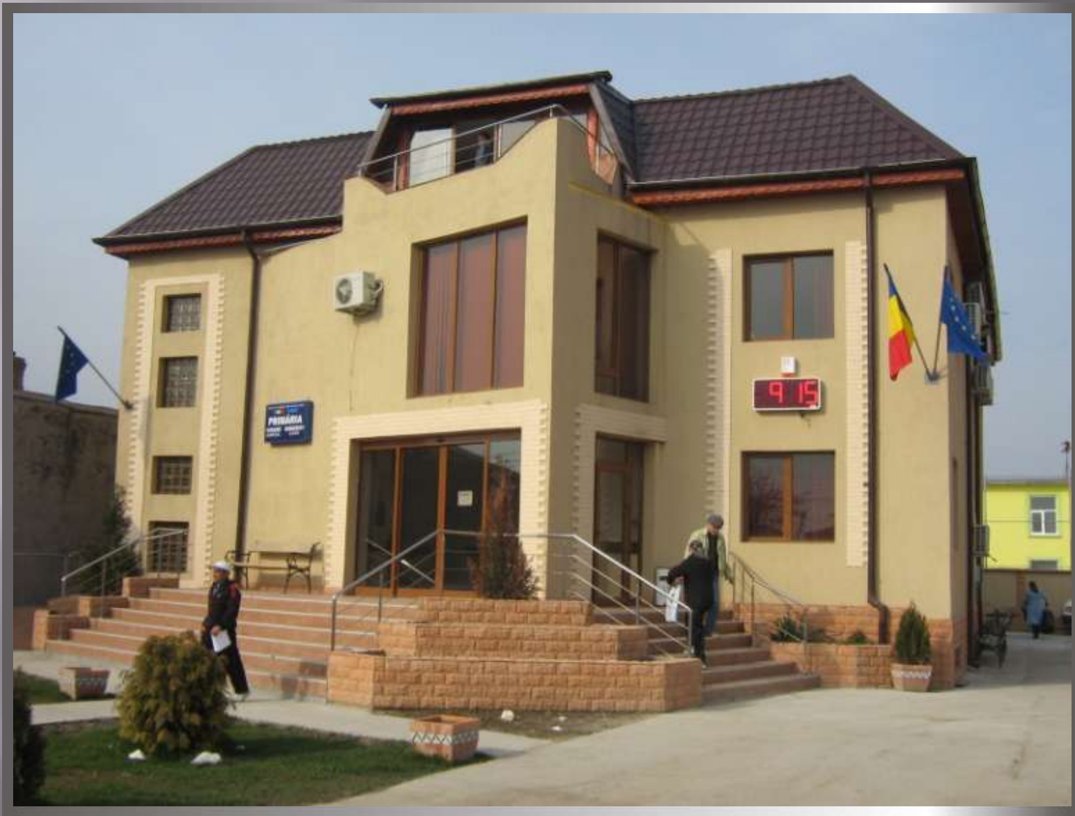
DOBROIEȘTI TOWN HALL