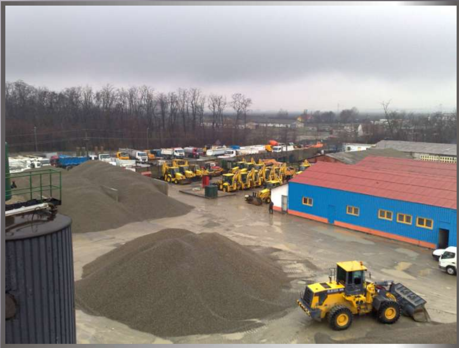
BACKHOES AND LOADER - POPESTI LEORDENI