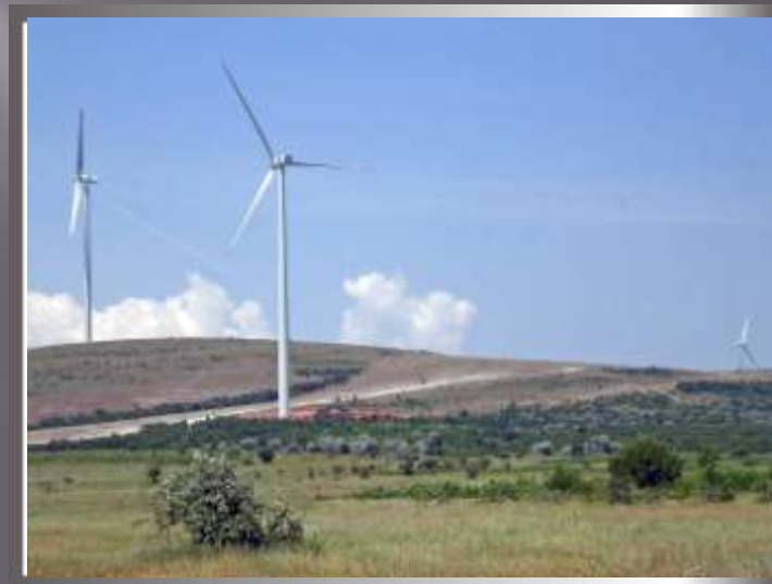
WIND FARM PARK 2 AGIGHIOL, TULCEA