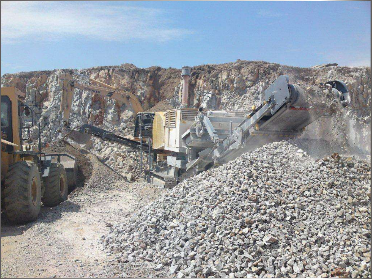
GRINDER - ZEBIL QUARRY